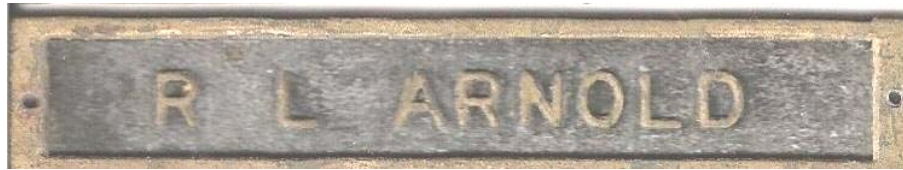
1 Central Avenue