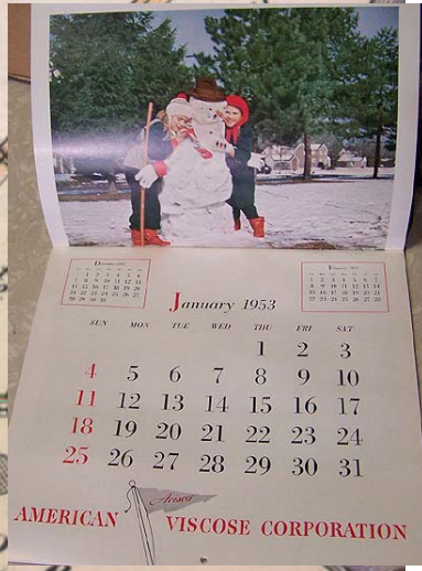
Viscose Calendar - 1953